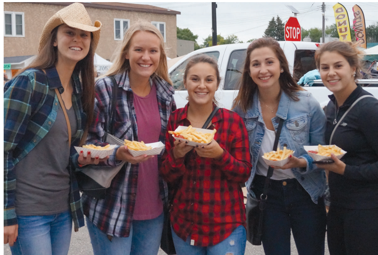
A mainstay of any festival is food and the Potato Days Festival is no exception. From the free French fry feed on Friday evening to the food court open Friday and Saturday. The food court offers everything from kettle corn to cheeseburgers and ice cream to potato sausage. Festival goers should not walk away hungry from the Potato Days Festival on August 24 and 25, 2018.