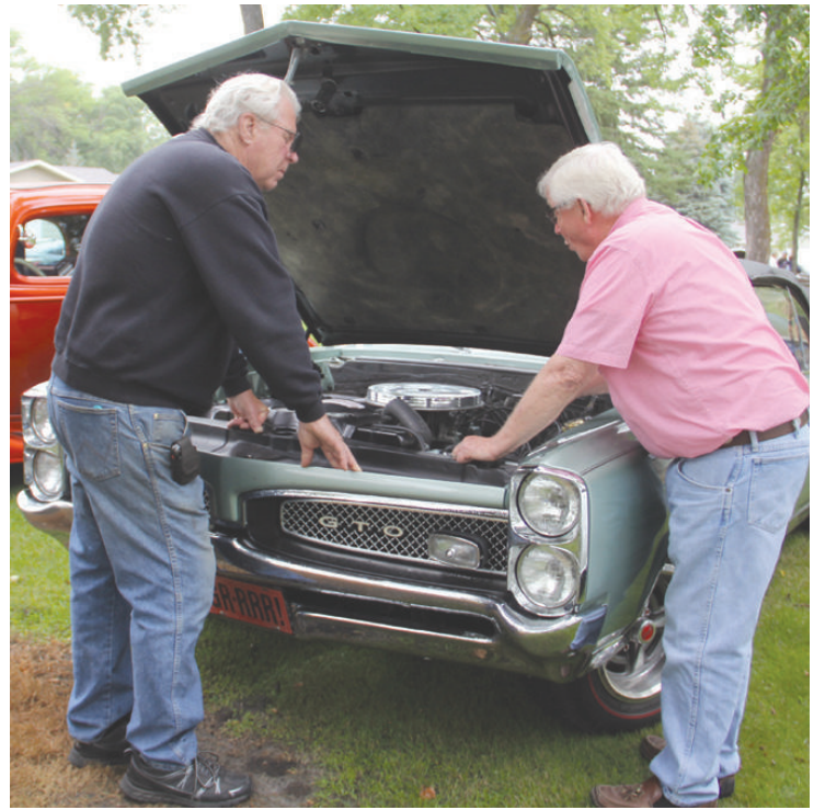
Barnesville Potato Days Classic Car Show

BARNESVILLE RECORD-REVIEW Barnesville, MN