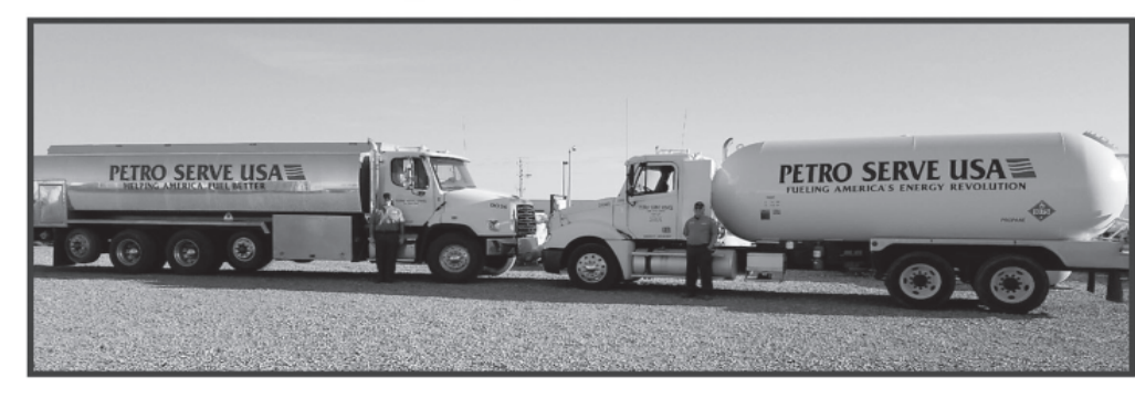
Filling your propane & fuel needs