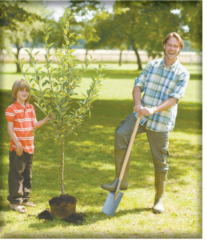
Learn the right way to plant a tree to improve the landscape and the environment.

North Carolina State University College of Agriculture & Life Sciences says trees absorb and block noise and reduce glare. They also can trap dust, pollen and smoke. tree can supply a day's worth Getting started Trees also absorb carbon dioxide and potentially harmful gasses from the air. One large pounds of carbon per year.