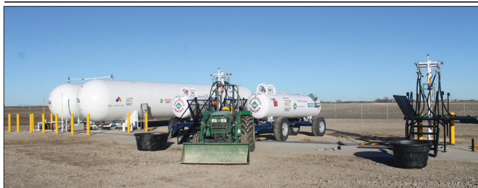
MKC improvements made recently included a new anhydrous facility. The facility includes two anhydrous tanks which hold a combined total of 56,000 gallons of anhydrous along with four filling stations.