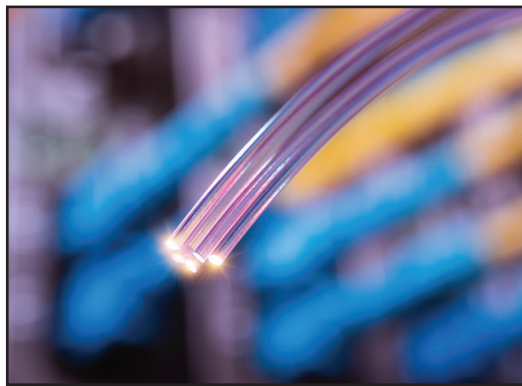
Fiber optics are thin strands of glass about the size of a human hair. They are arranged in bundles and transmit information over long distances by turning electronic signals into light.