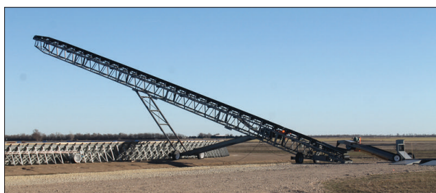
The new MKC grain bunker includes a large motorized grain conveyer belt. The conveyer belt can be moved as needed.