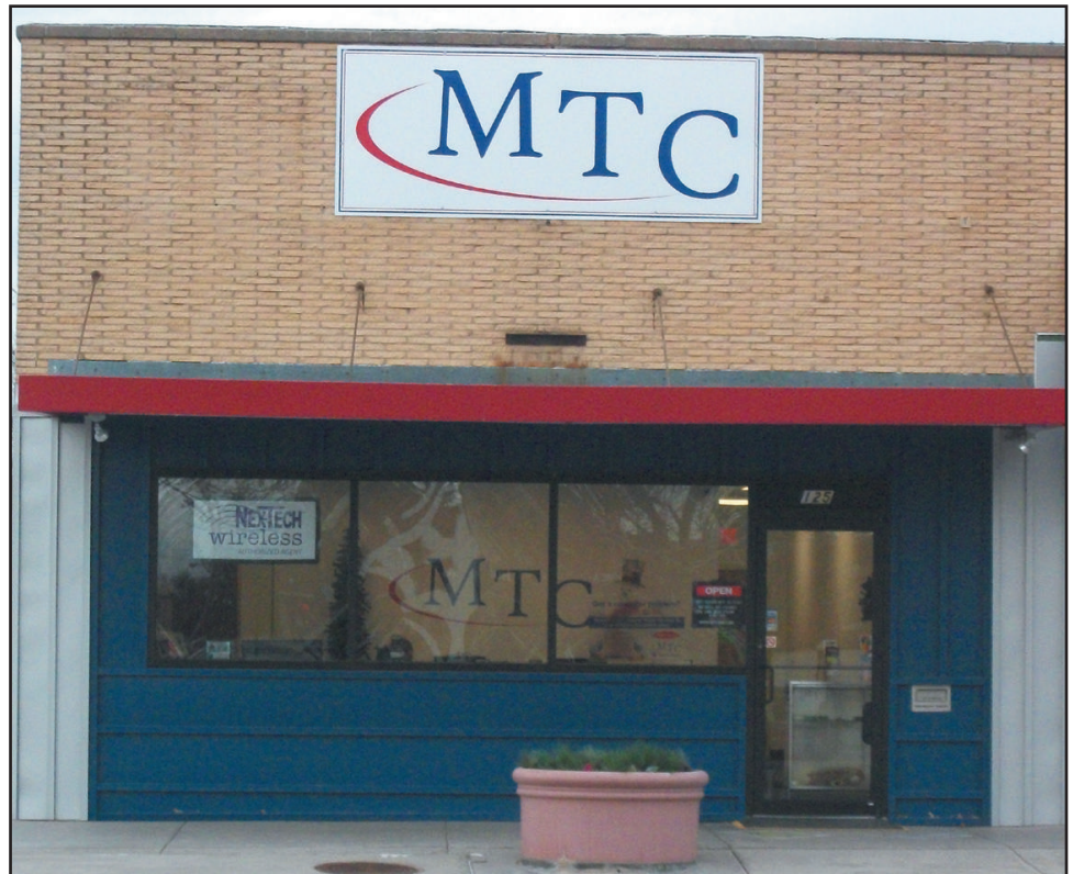
MTC has local offices in Lyons (pictured above), Sterling and Little River.