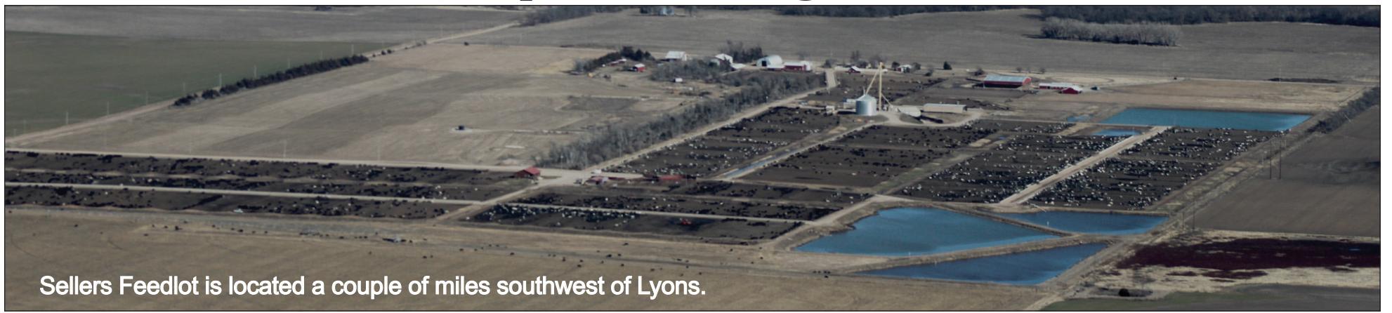
Sellers Feedlot is located a couple of miles southwest of Lyons.

For six generations, Sellers Feedlot of rural Lyons has had a hands-on approach to their feedlot operations.