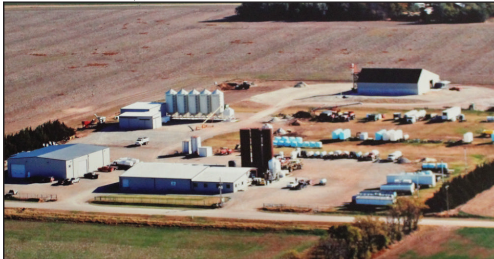
This is a recent aerial photo of the B.Z. Bee, Inc facility at 1240 15th Road. The business is owned by Craig and Kenneta Zwick and specializes in input products for crop production.