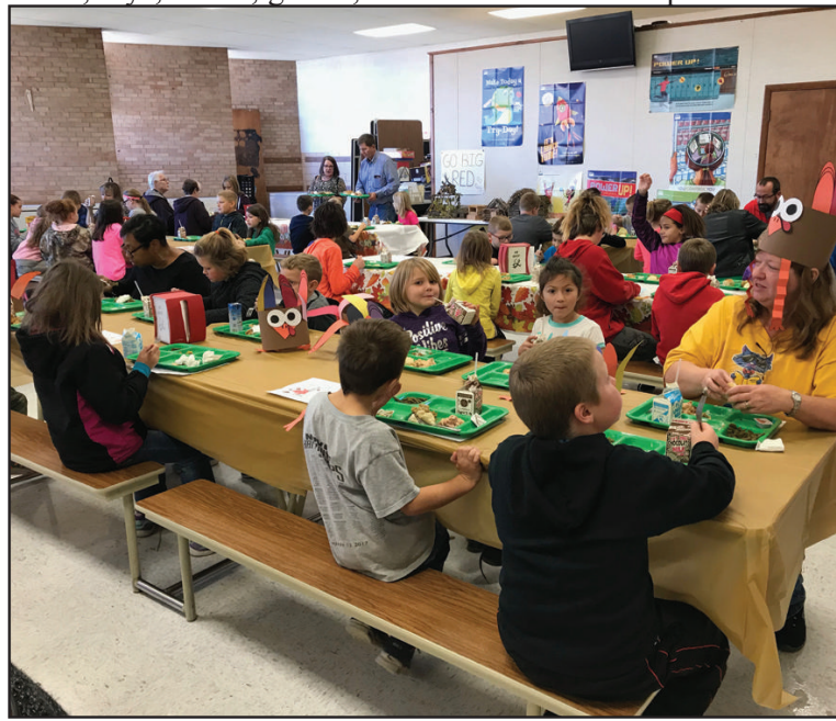
Chase Grade School students and teachers gather for Thanksgiving dinner. To help celebrate the special meal, staff members placed tablecloths on the tables and K-12 students colored placemats. The kindergarten and the first grade classes also made turkey hats to wear. Parents, grandparents, board members and community members joined the students for the meal.