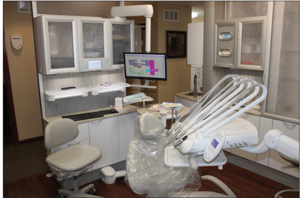
A brand new state of the art facility and caring, professional service await patients that visit Lyons Dental Care.

For nearly 52 years Dental Care at 220 W. Commercial Ave has been available to residents of Lyons, Rice County, and surrounding areas. A totally renovated office and the addition of state of the art equipment allow for the most modern dental procedures in a comfortable environment.