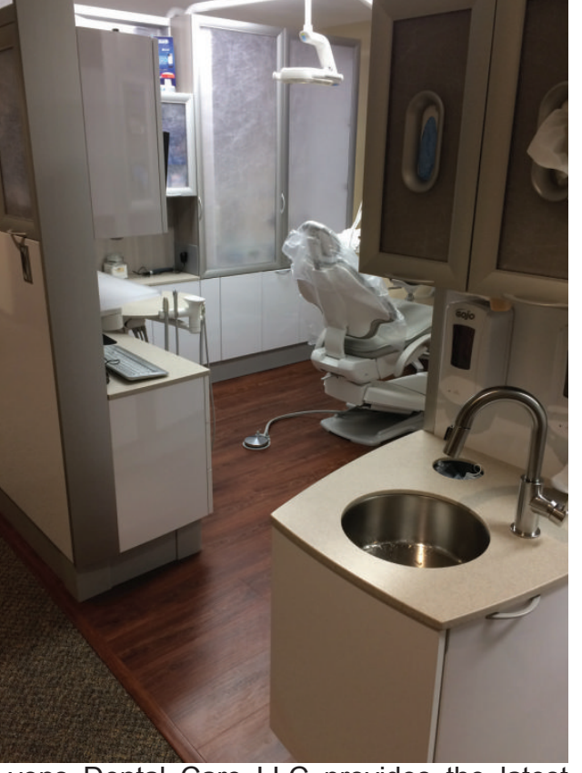
Lyons Dental Care LLC provides the latest technical advancements and quality care for every patient.

Sleep Apnea/ Snoring Oral appliances can benefit patients with mild sleep apnea. Snoring appliances create a better night sleep for the patients and those