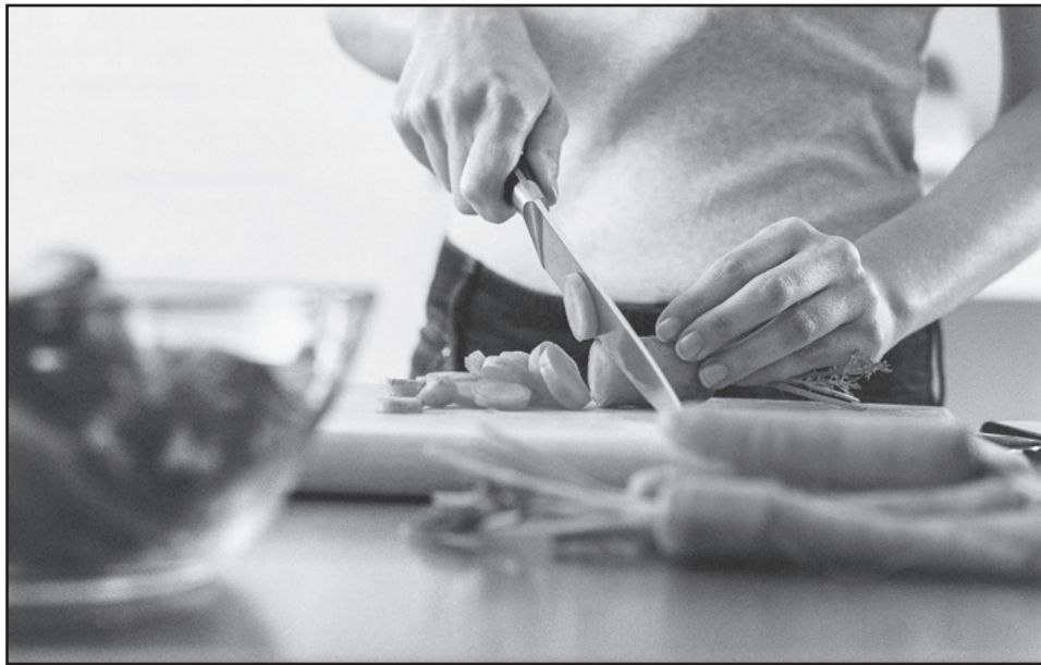
Finding ways to spend less time in the kitchen can free up leisure time for people who do not have a passion for cooking.

women spend 70 minutes per day on such activities. Meal delivery services can cut down on the time it takes to prepare meals, opening up more leisure time for people who want to spend less time