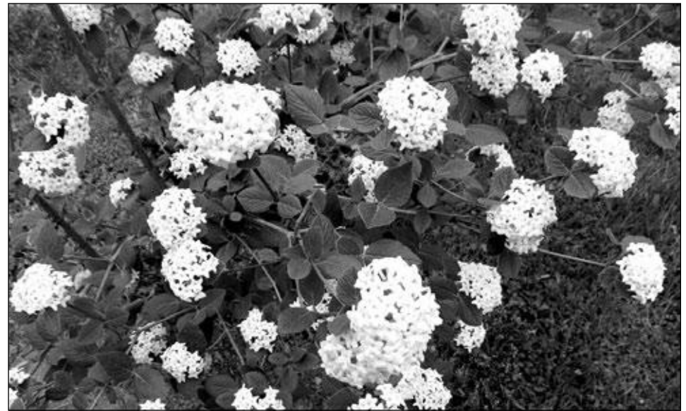
UT Gardens' April 2018 Plant of the Month: Koreanspice viburnum Koreanspice viburnum, or Viburnum carlesii , is one of the most fragrant spring-flowering shrubs you can have in the landscape.

For further information, contact Madison County Extension Agent; Celeste Scott at 731.668.8543 or cscott52@utk.edu.