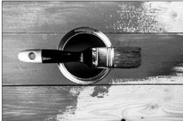
You'd be surprised what can be done in one weekend.

• Dress up the entryway. An entryway is a guest's first impression of a home. Many entryways can use a