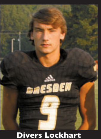
Jr. • WR/DB