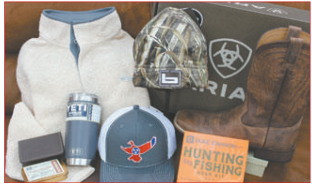
HEAD TO TOE — Vincent Outfitters in the University Plaza Shopping Center in Martin can outfit every man in your life, for work and play. With the best selection of outdoor clothing and accessories for the working men to hunters and cowboys, wishes will come true when you shop at Vincents.