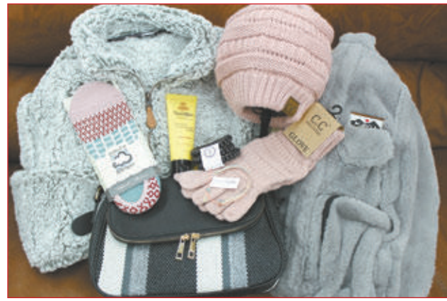
THE WEATHER OUTSIDE MAY BE FRIGHTFUL — But you'll be snug as a bug with warm weather wear from Vincent Outfitters in the University Plaza Shopping Center in Martin. You'll find all the season's hottest items in fashion, footwear, jewelry and accessories to complete your look and make everyone on Santa's good list happy.