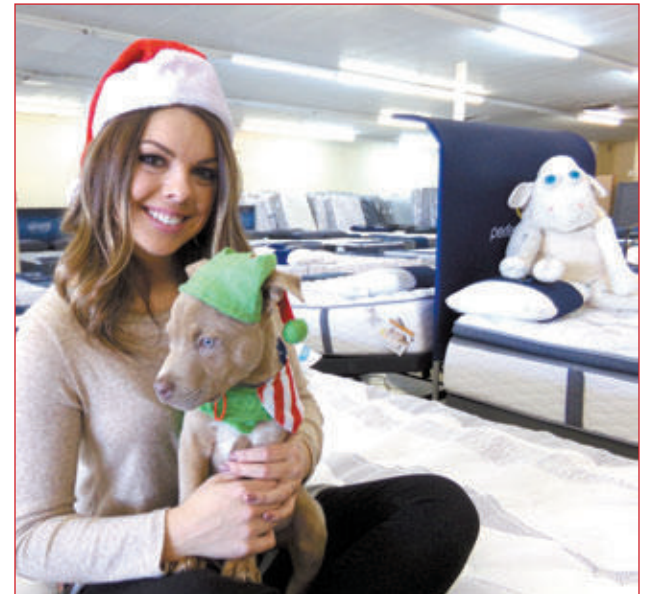
DREAMS DO COME TRUE — When you shop at Wade's Mattress Gallery on North Lindell in Martin, you'll find the best sleep solutions in the area. The right bedding and pillows will help you get the rest that you need to get you through your busy days feeling well-rested and refreshed.