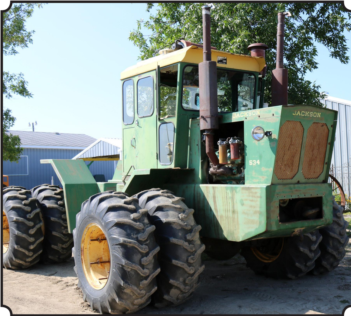
This Homebuilt Jackson looks tough and powerful.