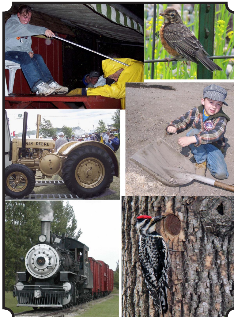
Things you see on random walks around the WMSTR grounds.