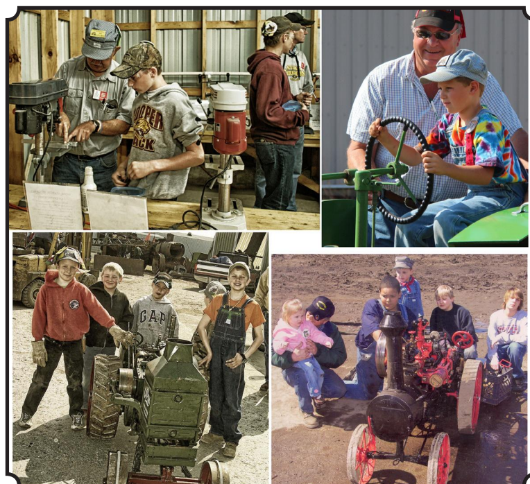
Kids of all ages scattered around Steamer Hill.