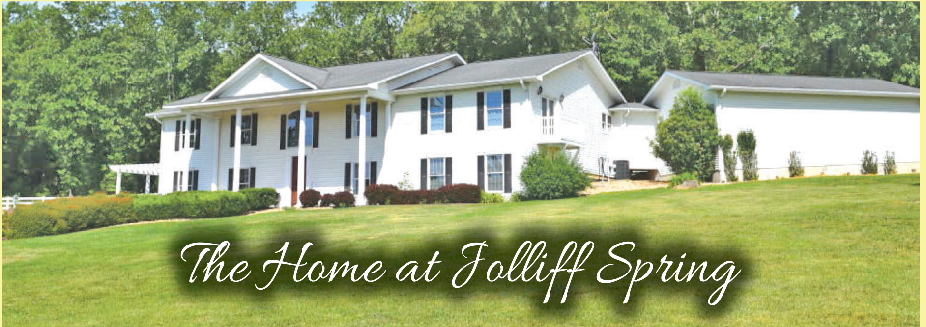
The Home at Joliff Spring