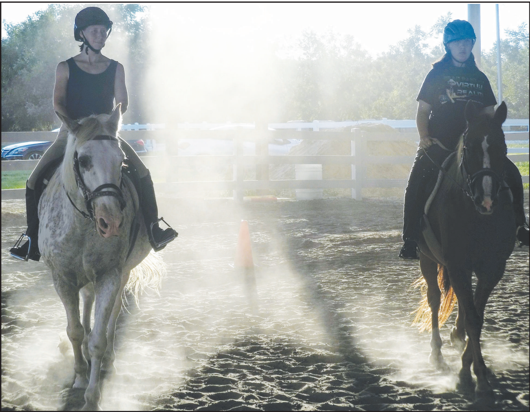
PHOTO SPOTLIGHT Jacob's Ladder Therapeutic Riding Center

If Jesus should called me to valleys dark Without a single ray of light Would I descend the mountain height And walk with Him in darkest night? Would I leave my flower strewn path To travel the Calvary way? Forsake all my friends and family With Jesus Christ as my only stay? How far, to please Him, would I go, And fulfill His holy desire? Would I willingly surrender my all And do whatever He requires? Would I leave and never stop to think What other men might say? Knowing that He who called me out, Will walk with me in life's way? Would I demand before I would leave To know just where and how? Or will I answer Love's pulling tide And go to Him right now? Oh wavering soul, oh faithless heart, Oh, why not have this thought?-- Why should I be as the changing wind, But never as I ought? To linger behind and pine away, And never go with Him; Beyond my sight, beyond what I feel, And there know only Him.