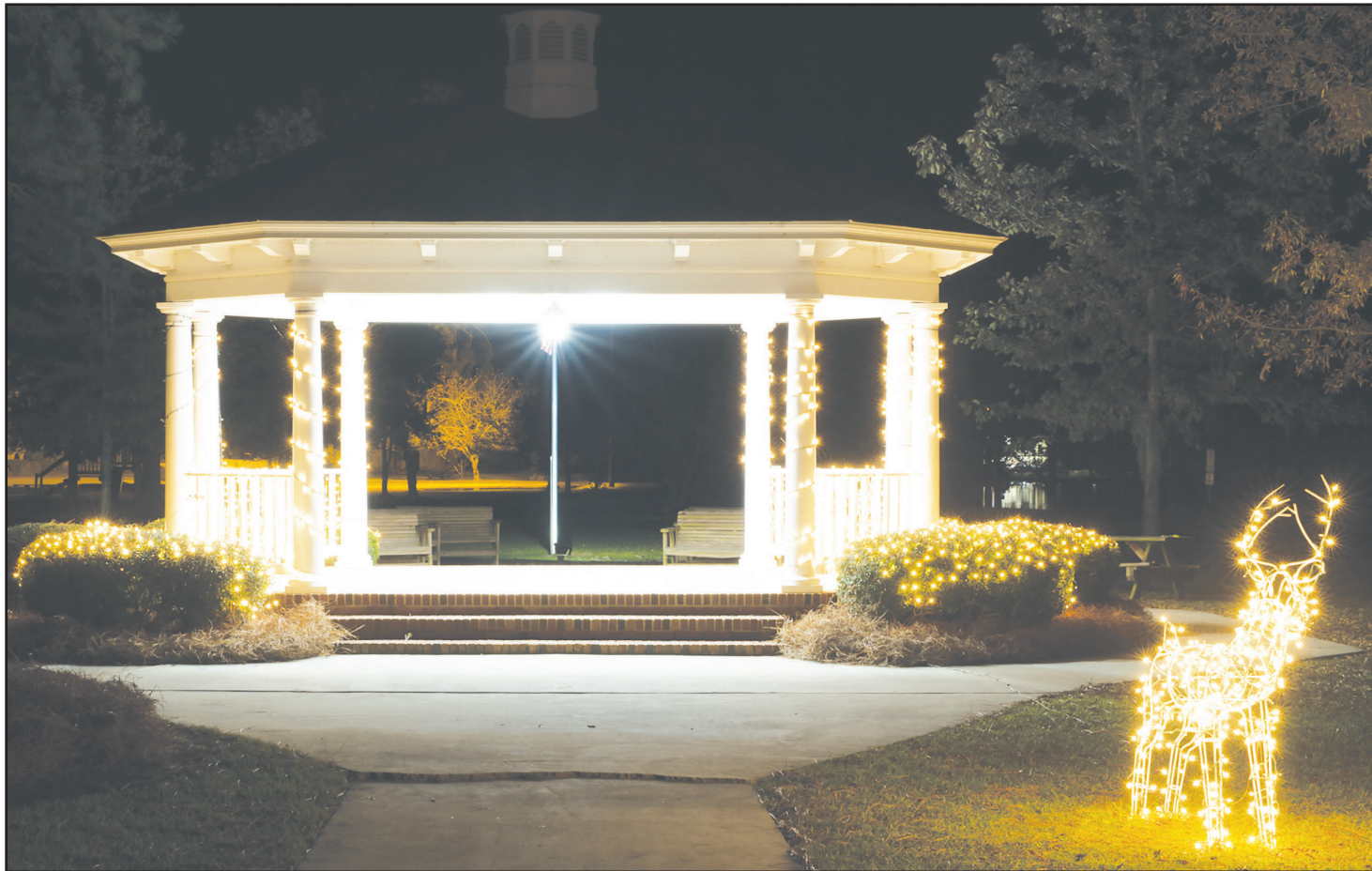
Roquemore Park's Gazebo is spectacularly lit with reindeer enjoying the view!

Thursday, December 13, 2018 Lakeland, Ga.