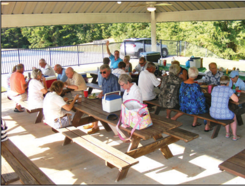
Members enjoy hot dogs and all the “fixings” at the Sept. 7 lunchtime meeting and pool party at the SLV pavilion.

and walked from boat to boat to enjoy the company of all. Because the sky was clear, the sunset was not colorful, but the moonrise about 30 minutes later was quite different. A large moon rose in the east to provide a spectacular scene of the orange disc, dark tree line and the moon’s orange reflection on the water. Shortly after the moon was above the tree line, the boats slowly cruised home to enjoy the evening’s view. On Friday, Sept. 7, TLS&PS