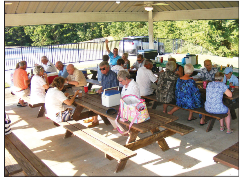
Members enjoy hot dogs and all the “fixings” at the Sept. 7 lunchtime meeting and pool party at the SLV pavilion.