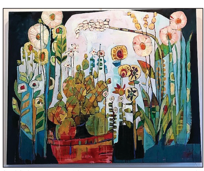
Staci Swider states she, "likes the colors to melt together overall with dancing bits of contrasting color and texture.