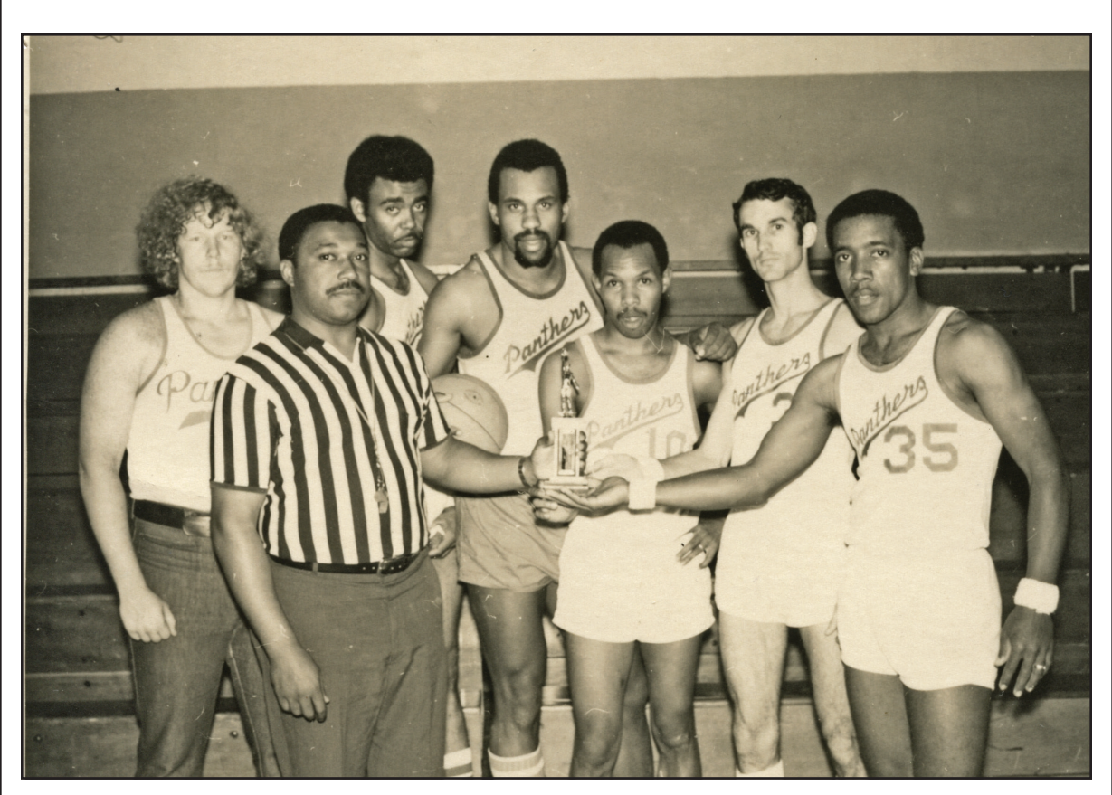
Back in the olden days

If you can identify this photo, give the Messenger a call at 852-3311 or email: mccmess@wctel.net