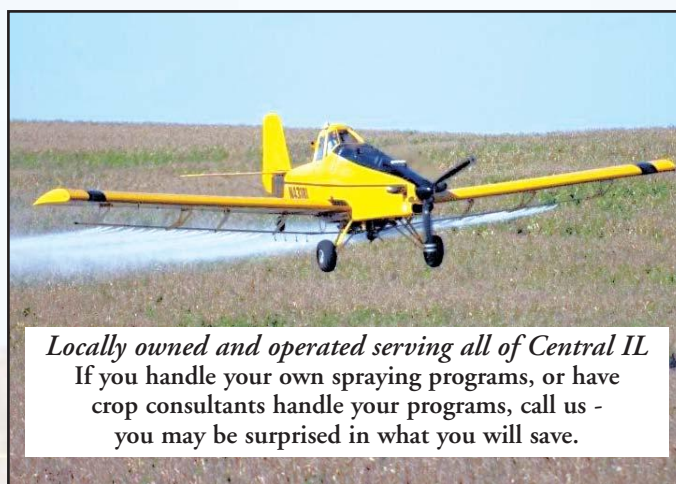
Locally owned and operated serving all of Central IL If you handle your own spraying programs, or have crop consultants handle your programs, call us - you may be surprised in what you will save.

Aerial application is often the safest, fastest, most efficient, and most economical way to get the job done. Aircraft help in treating wet fields and spraying when crop canopies are too thick for ground rigs. When pests or disease threaten a crop, time is critical. An airplane or helicopter can accomplish more in one hour than ground equipment can in one day. This means less fuel used, less air pollution and no soil compaction. Aircraft are necessary to low or medium-tillage farming systems, which can reduce soil erosion by as much as 90%. Aerial application provides food and fiber for the world's growing population and protects our natural resources.