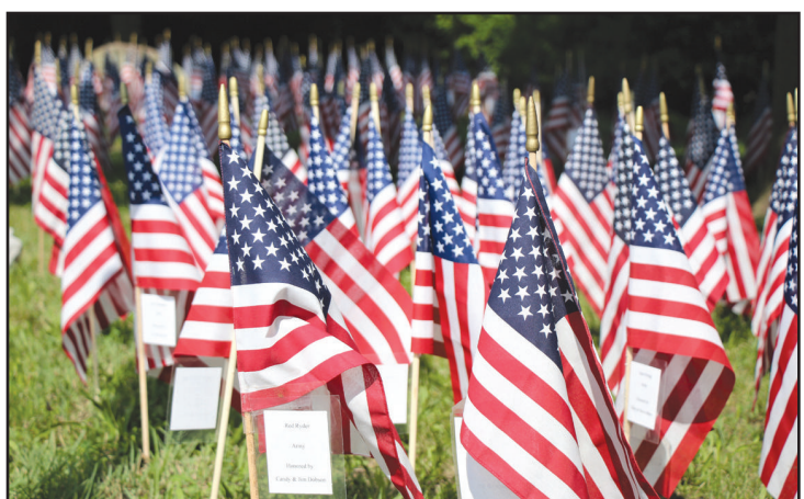
A total of 212 American flags were purchased and displayed at the Cerro Gordo American Legion Auxiliary annual Flag Garden ceremony held downtown on July 4. The Flag Garden is dedicated to the memory of those who fought to keep the freedoms that were incorporated into this country at its beginnings. The flags serve as a remembrance of the fallen heroes, those currently serving and loved ones from the Air Force, Army, Marines, Navy and POW/MIA. Additional photos on Page 9.

Ideas were discussed on where and when to have their 60th class reunion in 2020. The remainder of the time was spent visiting.