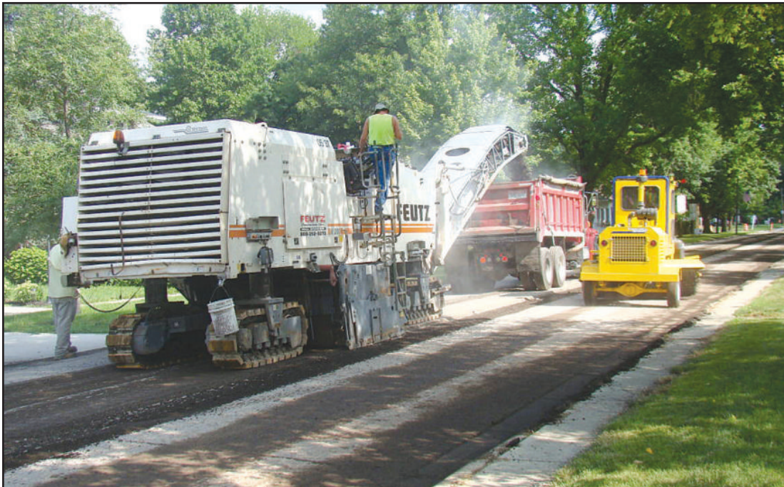
The milling machine of Feutz Construction was interesting to watch as it took away about three inches of asphalt.