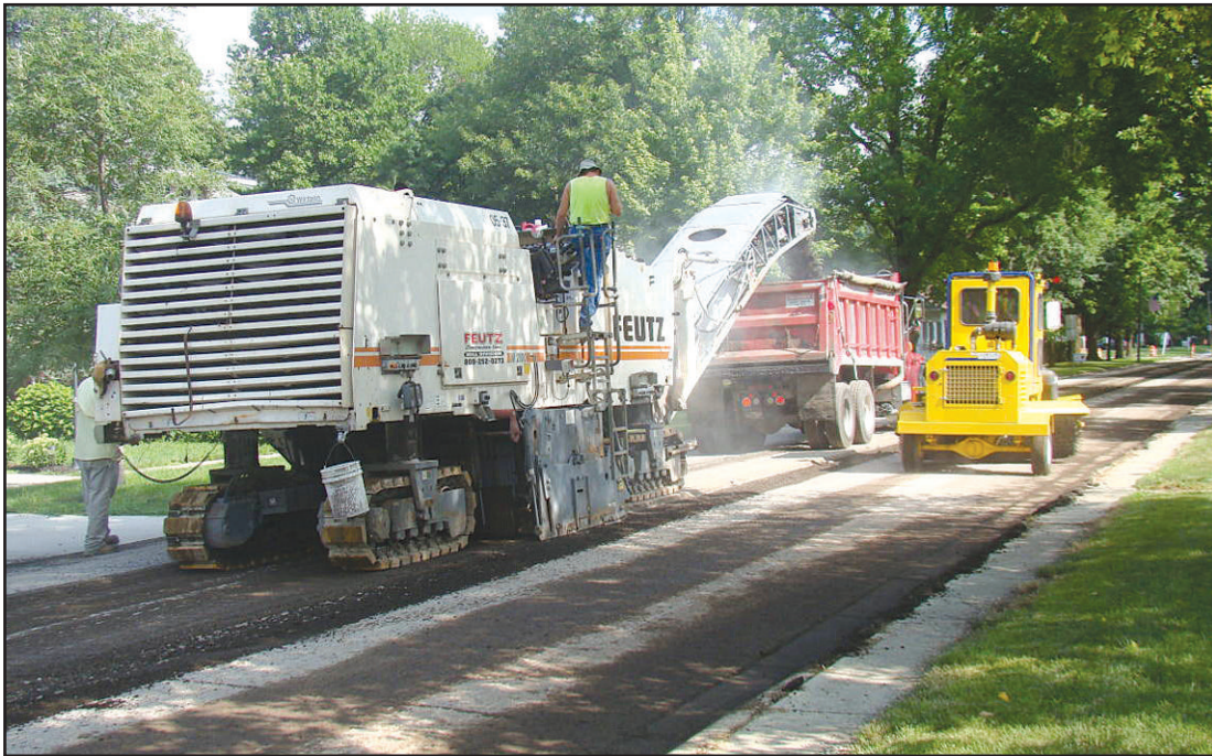
The milling machine of Feutz Construction was interesting to watch as it took away about three inches of asphalt.

Grade school principals (Continued to Page 7)