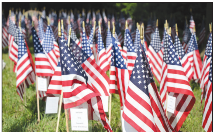
A total of 212 American flags were purchased and displayed at the Cerro Gordo American Legion Auxiliary annual Flag Garden ceremony held downtown on July 4. The Flag Garden is dedicated to the memory of those who fought to keep the freedoms that were incorporated into this country at its beginnings. The flags serve as a remembrance of the fallen heroes, those currently serving and loved ones from the Air Force, Army, Marines, Navy and POW/MIA. Additional photos on Page 9.

Mark your calendars, dig out those dancin' boots and join us for a fun evening of music and dancing!!