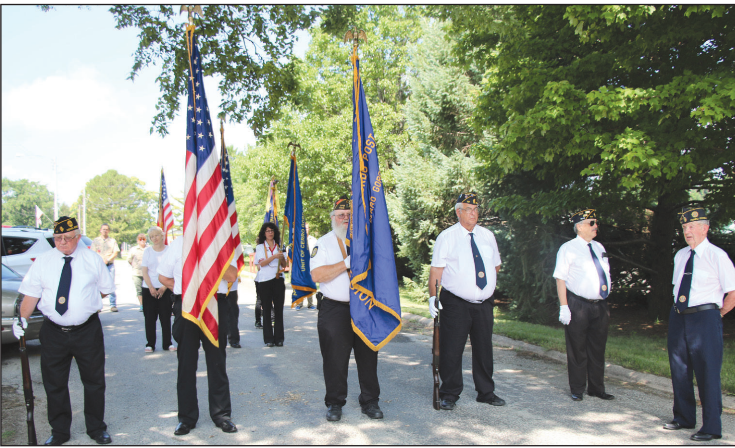
Cerro Gordo American Legion Post #117 and Auxiliary Color Guard along with Junior Auxiliary members and Boy Scout Pack #39 gathered at the Commons on a warm July 4 morning.

You are guaranteed to have a fun day at the Apple Dumpling Festival Aug. 17 & 18 and a special place in the parade. Watch this newspaper for more upcoming news on the festival.