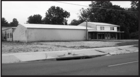
815 South 3rd • Retail / Rental $169,000