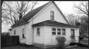
104 W Union, Donnellson 2BR, Make Offer $24,900