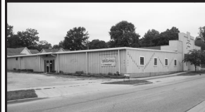
201 S. 4th • Retail / Manufacturing Possible CFD $225,000