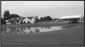
1816 Trapper Ave., Mulberry Grove • 3 Acres Pond, Additional Acres Available $349,000