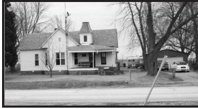
1538 State Hy 140, Smithboro 3BR Country Home $59,000