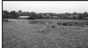
835 Hy 40 • Farming/Timber 92 Acres