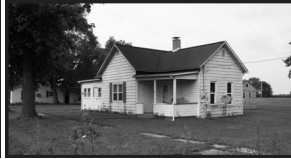
204 Washington, Smithboro • 2BR Priced To Sell $22,000