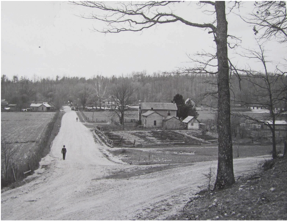
Taskee Station had its start in 1889 when the railroad was extended to that point. A post office called Taskee Station was established in 1890, and remained in operation until 1941.