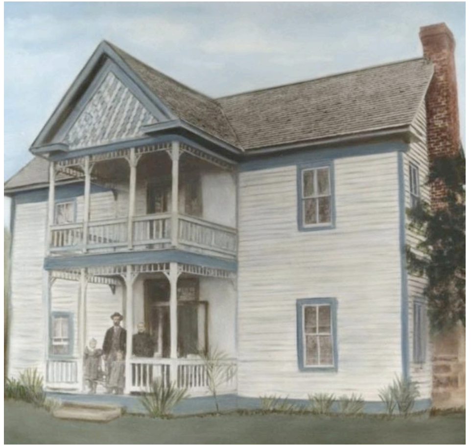
The original farm house on the Lewis Family Farm (now Twidwell Farm) at Lodi.