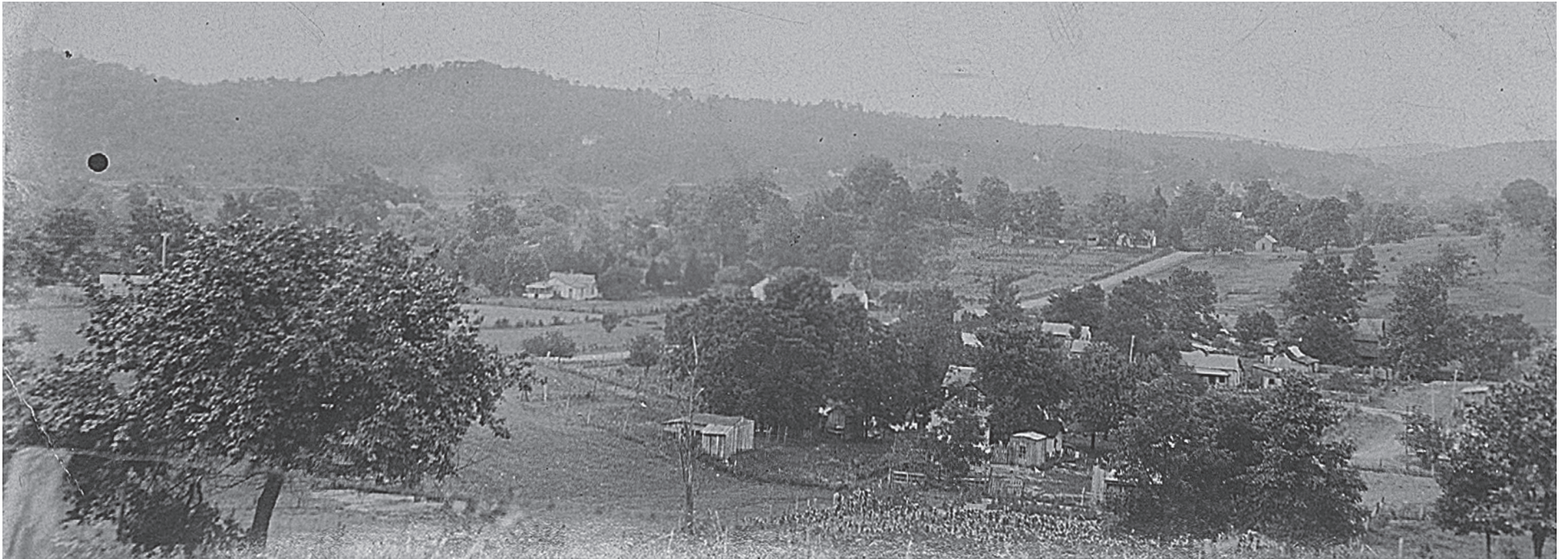
This is a 1927 view of Piedmont.