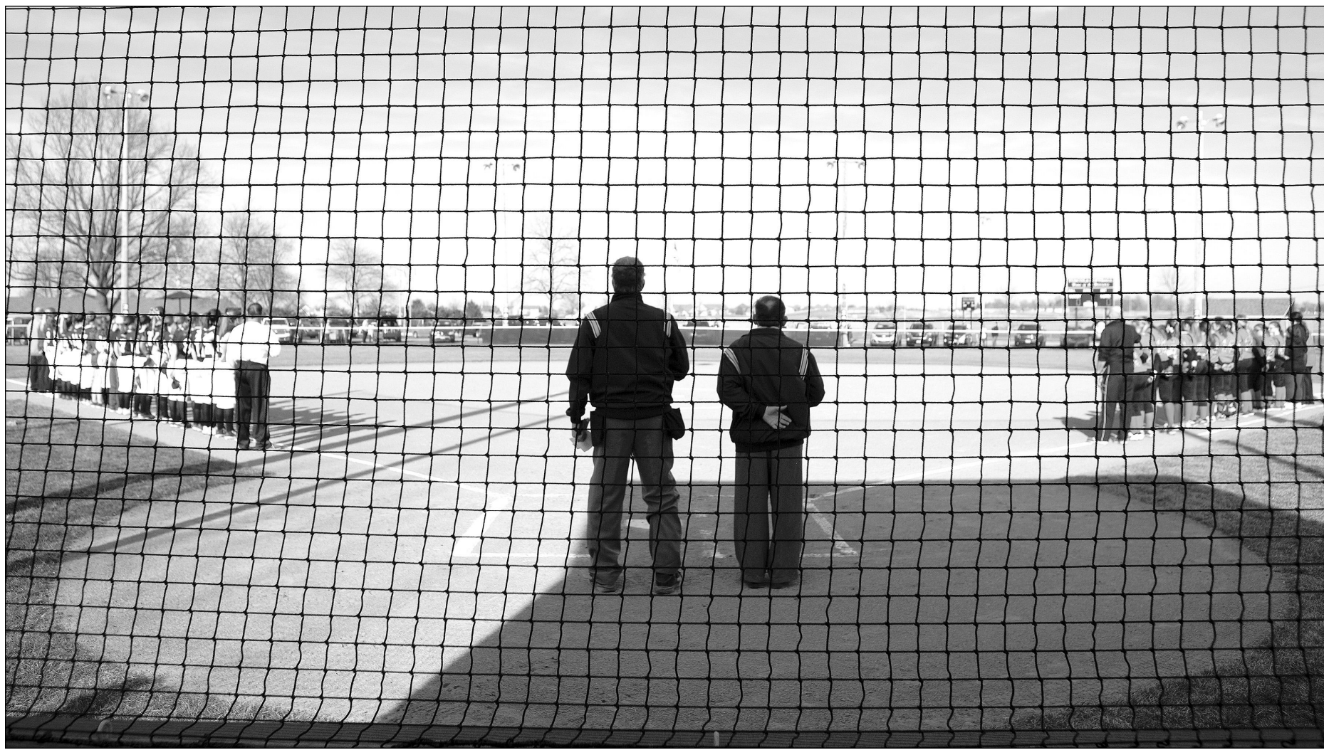
The Tuscola Warriors during and the A-L/A-H Knights stand on the base-lines during the playing of our National Anthem.

ALAH battled its way out of the sixth and knotted it at three in the top of the seventh with back-to-back-to-back base knocks before Reifsteck fanned the final two leaving it tied. The Lady Knights set the Warriors down in order forcing the extra frame. Reifsteck fanned