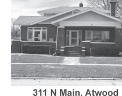
311 N Main, Atwood