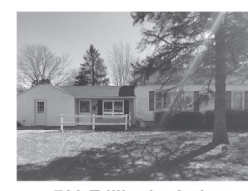
709 E Illinois, Arthur