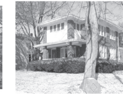
229 E Jefferson, Arcola