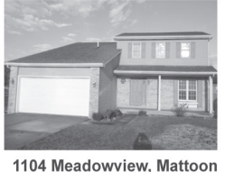
1104 Meadowview, Mattoon