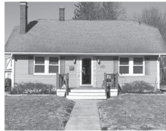
210 E Logan, Arthur