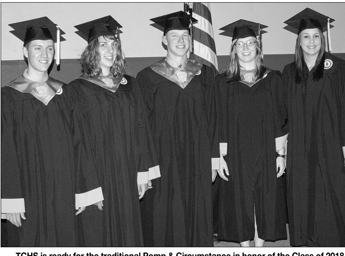
TCHS is ready for the traditional Pomp & Circumstance in honor of the Class of 2018. Do you recognize these grads of yesteryear. If so, let us know at The Tuscola Journal.