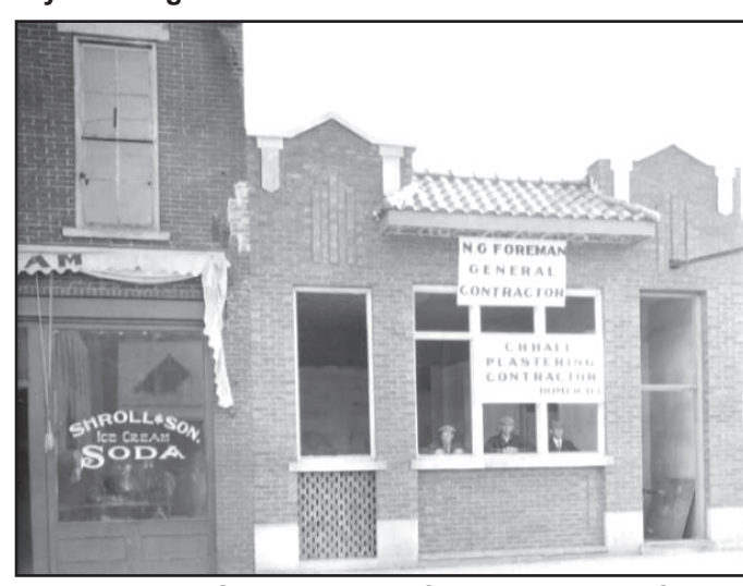
Photo Above: Construction of the Telephone Company building. Photo Below: Interior of phoen exchange.