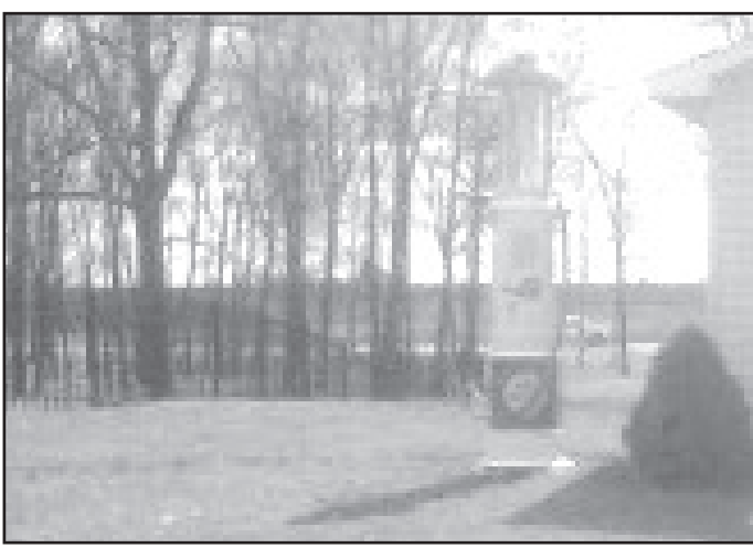
Old Gas Pump located in Philo, IL. Readers Response; The caboose (published 3/14) was obtained by the Village of Homer in 2001 and arrived on a siding in July. It was moved into place November 2, 2001. This became the center of what is known as the Caboose Park with a gazebo. This is on the former site of a hardware and grocery store that existed for nearly a century at the corner of Main and East First Street. The Douglas Telephone Company office (published 3/7) was constructed in the fall of 1915. The chocolate-colored face brick was adorned with red Spanish tile. This was constructed on the site of the Gray building, which burned on December 26, 1910. Ray Cunningham