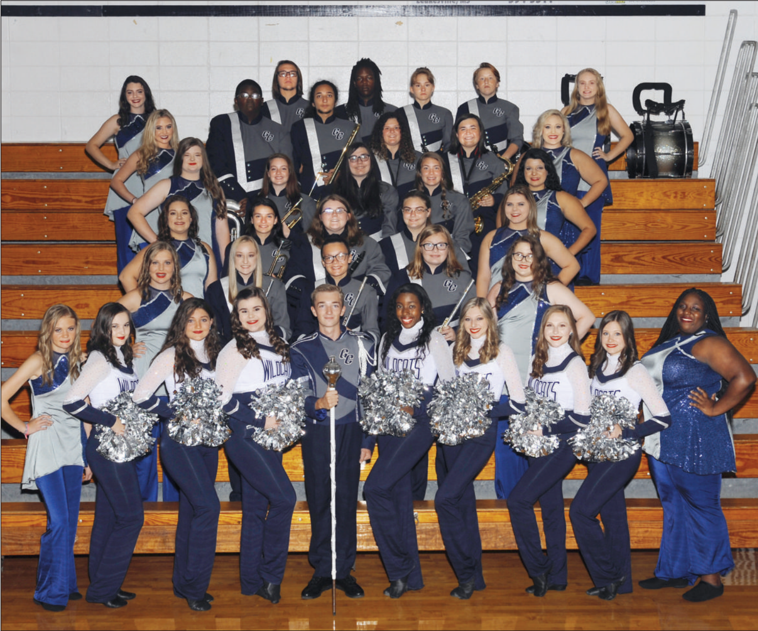
The GCHS Marching Pride Band