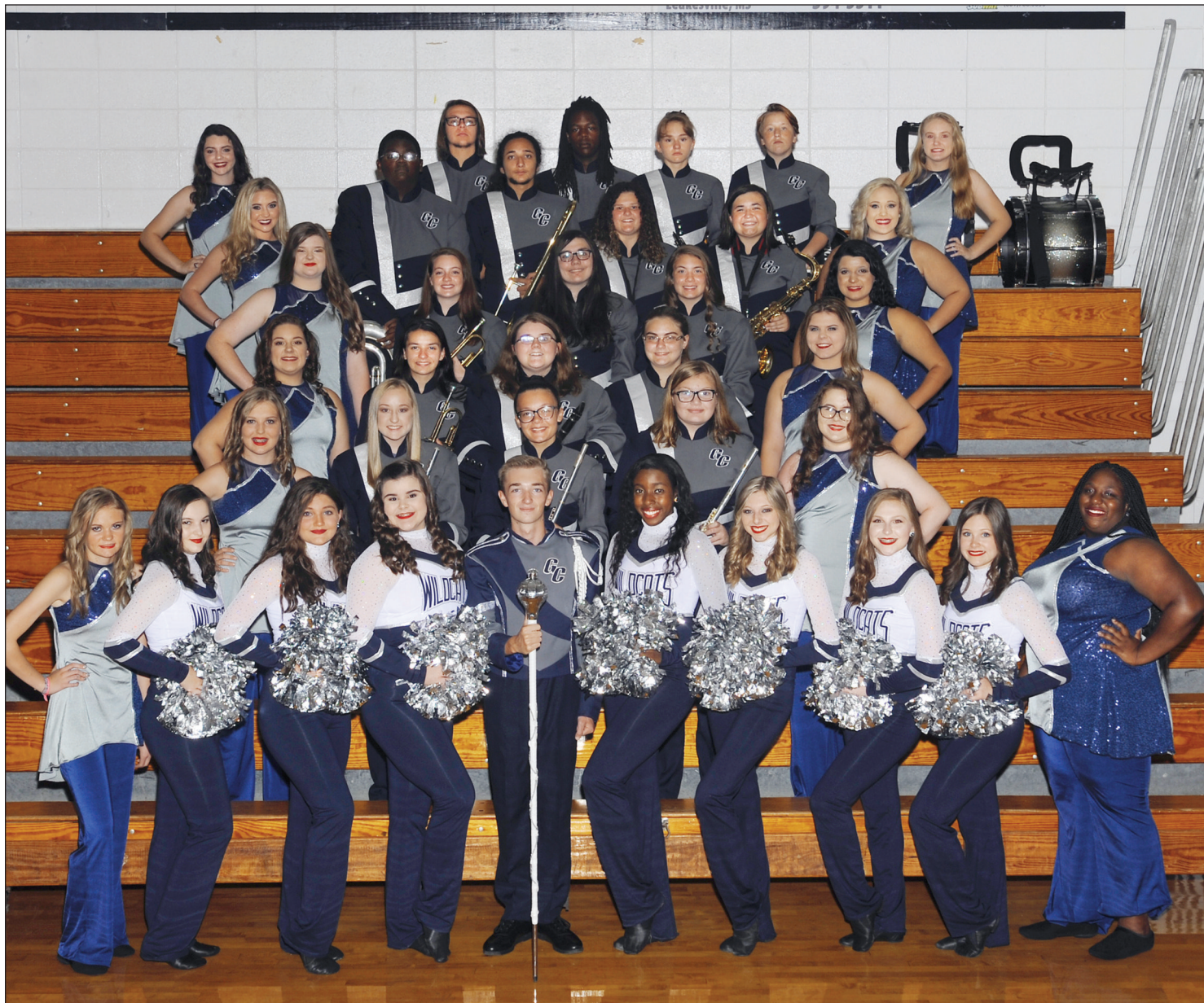
The GCHS Marching Pride Band