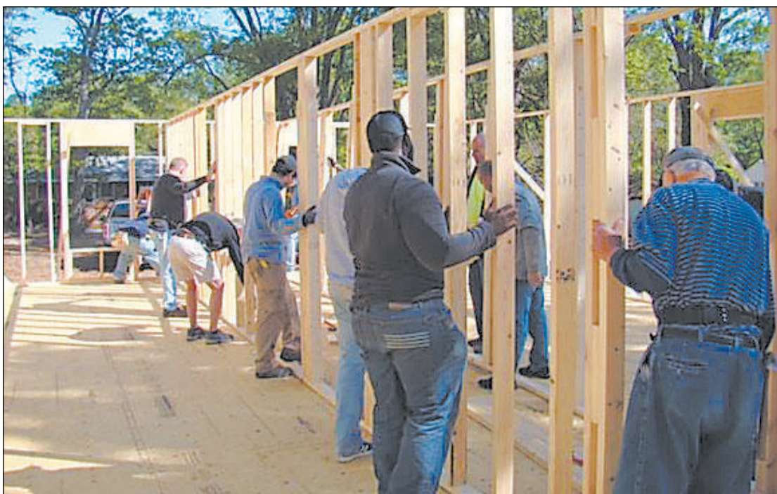
ON THE JOB — Habitat for Humanity volunteers work together on the Campbell Street project in 2018.