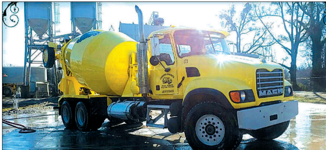
COMMUNITY SUPPORT — Trucks owned and operated by Carolina Concrete are typically recognizable by the company's signature yellow, with logos for area sports teams. The Clinton-based business provides quality concrete services and is a strong supporter of the local community.