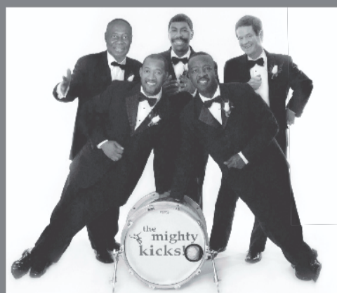
The band has performed worldwide playing a mix of Motown and Top 40 Dance Songs combined with high-energy choreography!