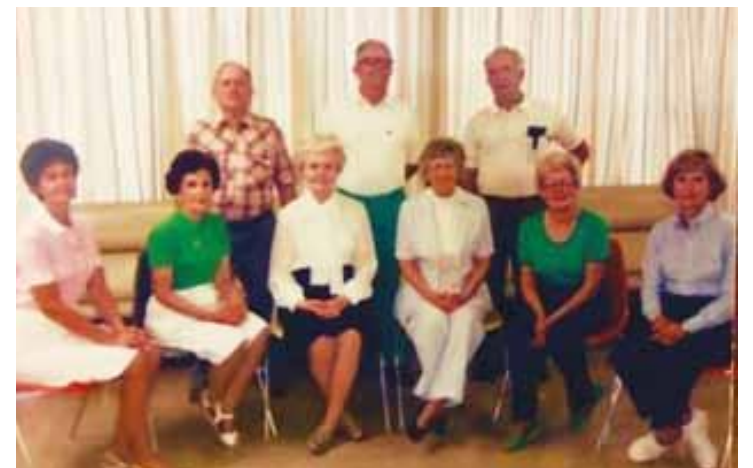
Parker family members pose for a past family reunion photo.