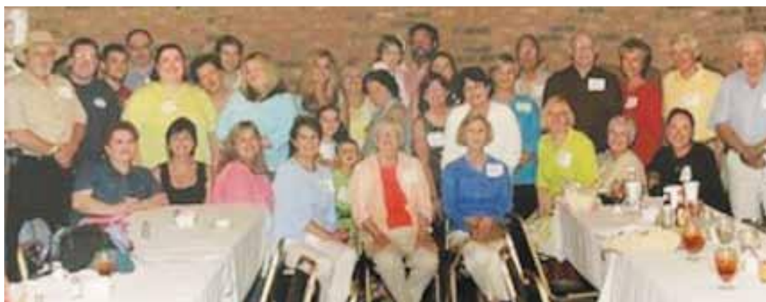
Parker family members pose for a past family reunion photo.