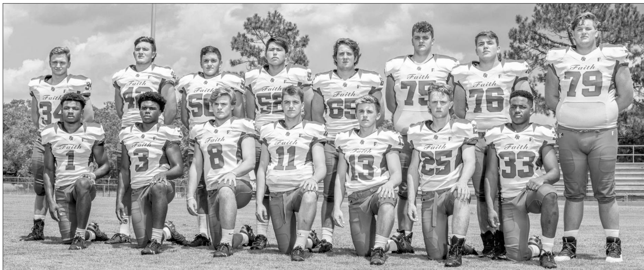
Seniors for the 2019 Faith Academy Rams