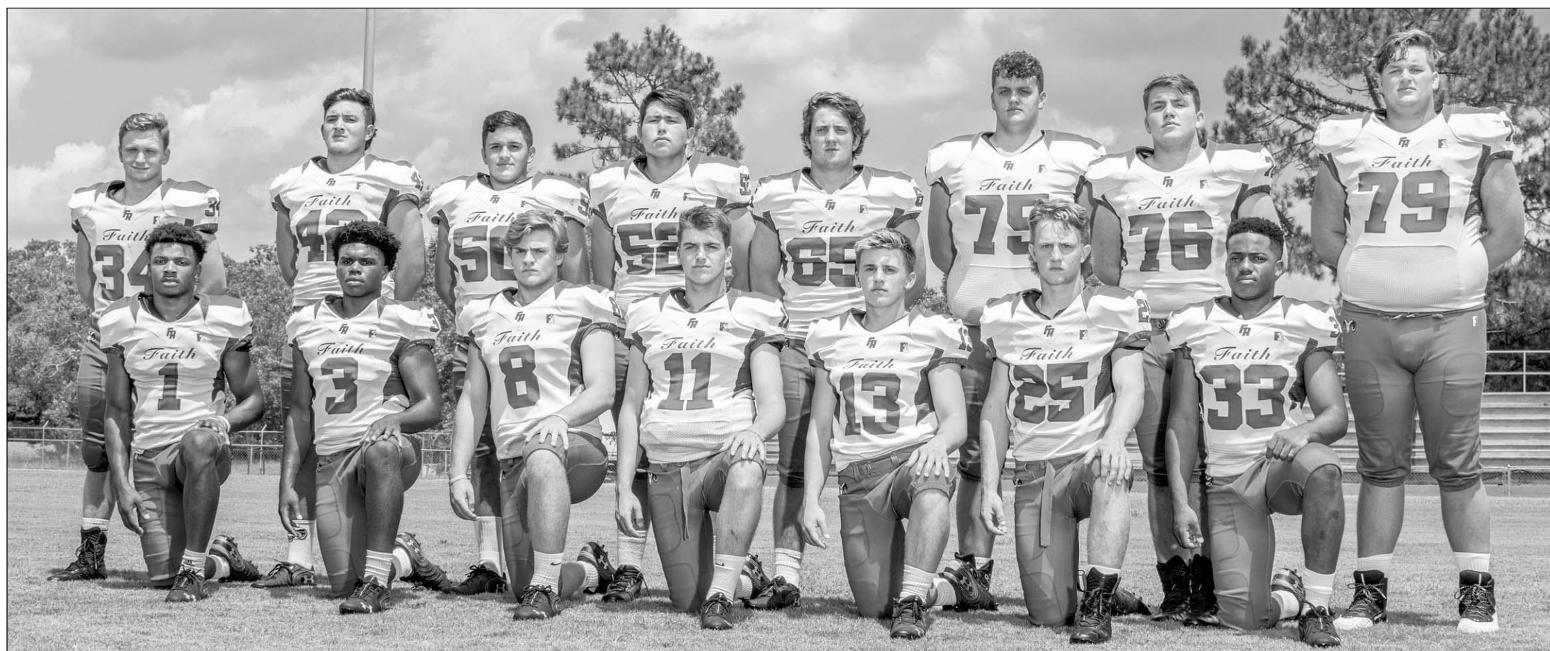
Seniors for the 2019 Faith Academy Rams