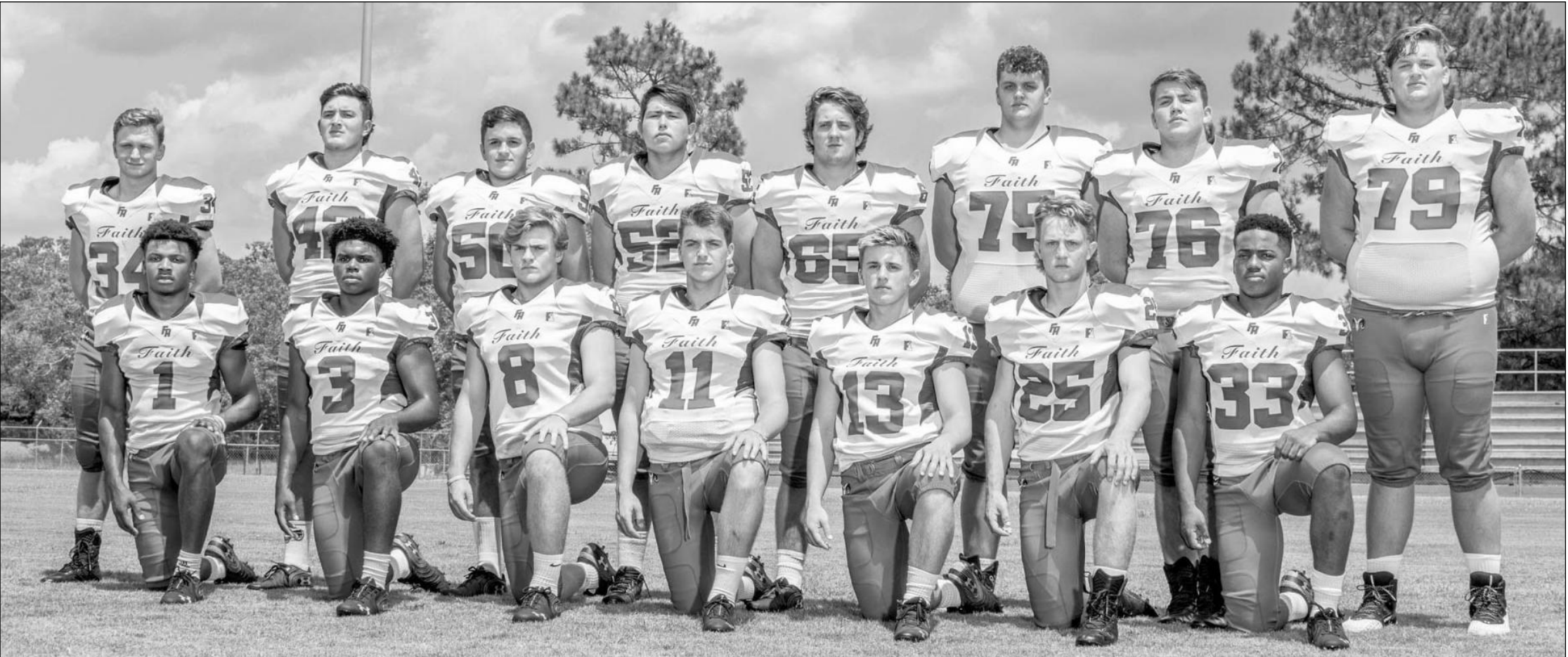
Seniors for the 2019 Faith Academy Rams