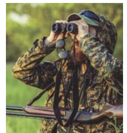
Always use a good pair of binoculars.