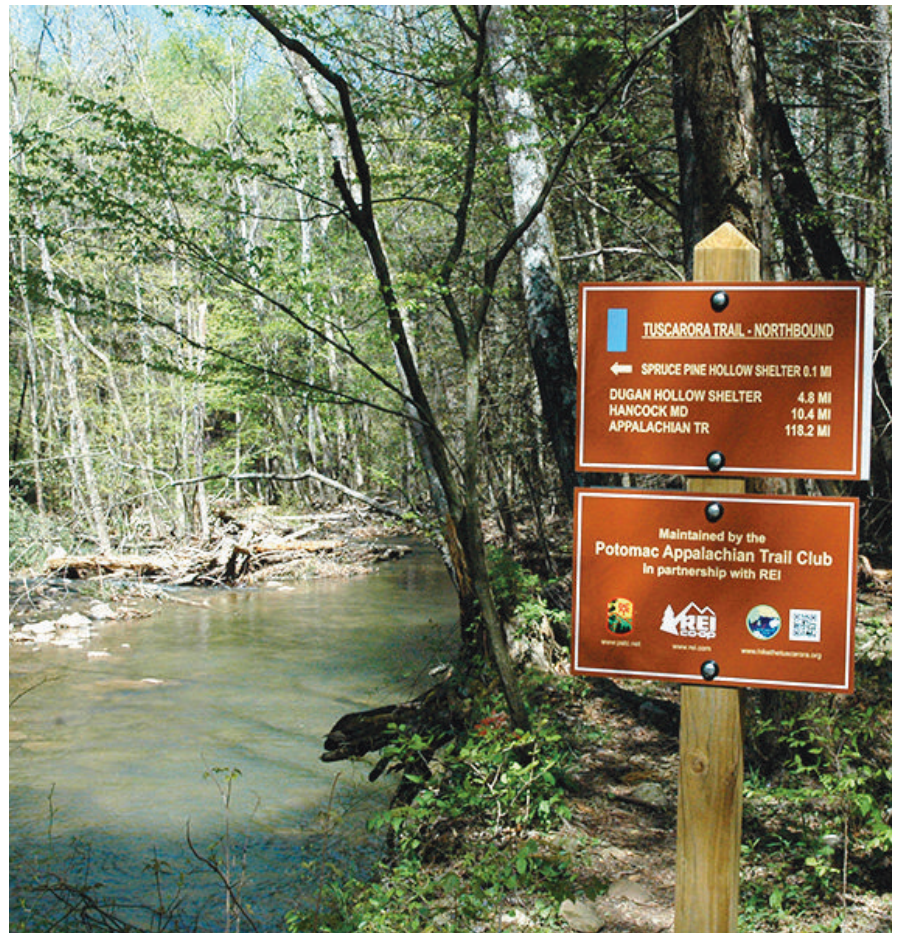
Tuscarora Trail sign along the meadow branch at Spruce Pine Hollow.

A driving tour map along the trail and the Cacapon River is also available at the Travel Berkeley Springs Visitor's Center at 127 Fairfax Street.