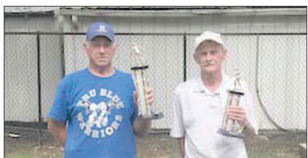
Men's 30 ft