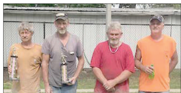
Men's 40 ft