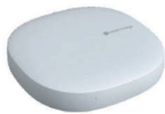
Samsung SmartThings Hub

Buy a new smartphone and get a gift for Dad valued at up to $250 - like a Spartan GoCam, a Braven 360 waterproof speaker or a SmartThings Hub from Samsung.