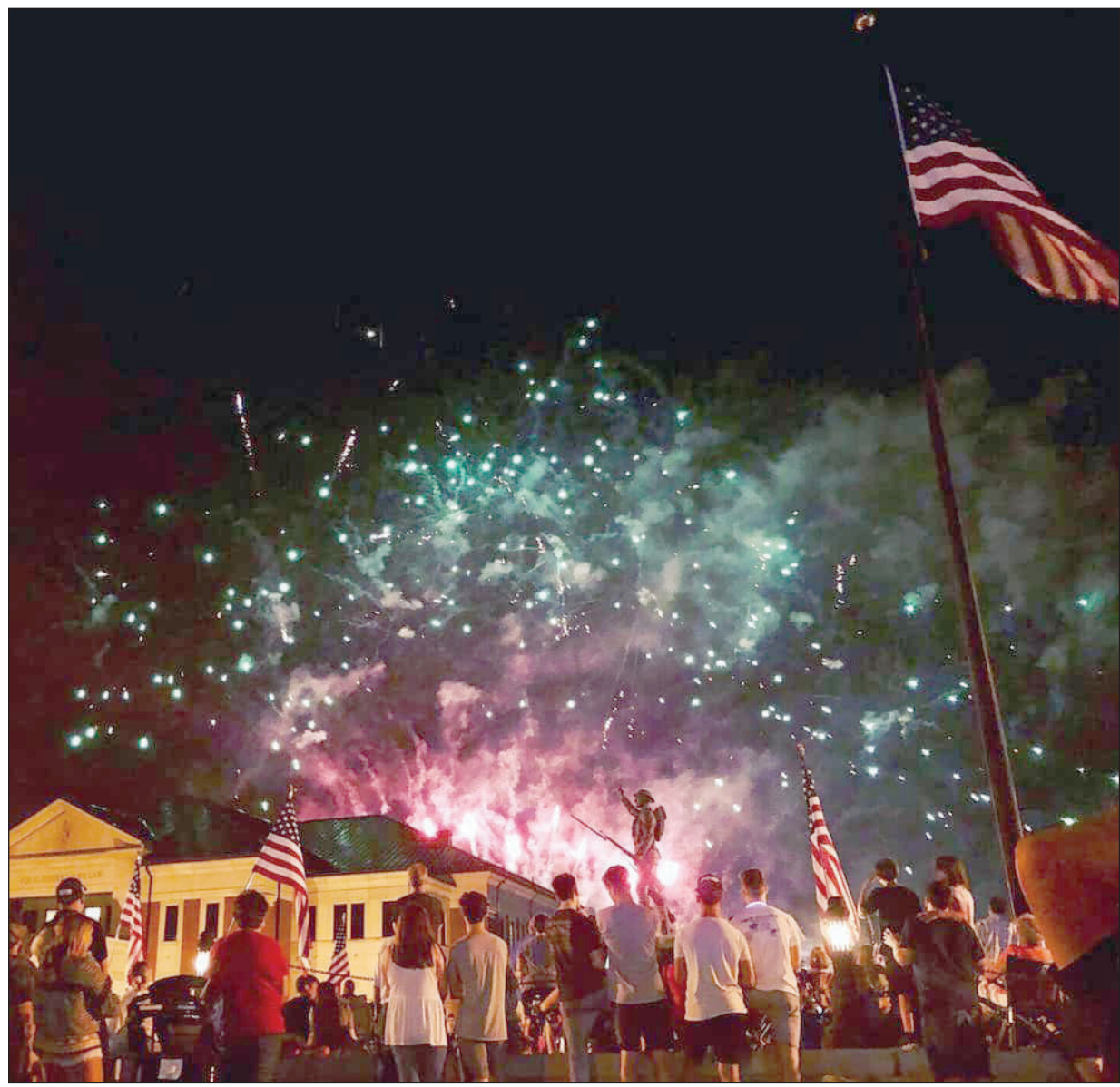
Fireworks over the Square in Jamestown during the 50th Anniversary Celebration of Lakefest.