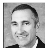
State Sen. David Givens

The 153rd Regular Session of the Kentucky General Assembly convened this week with more than 150 prefiled bills awaiting consideration.