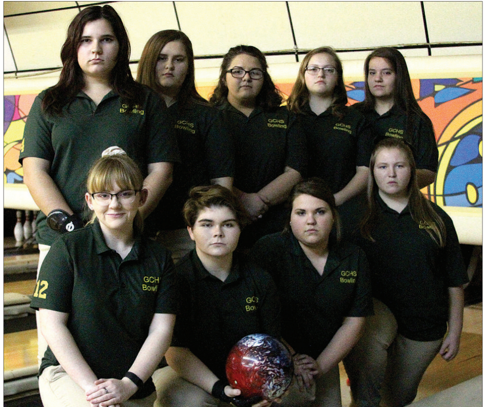
The Green County Lady Dragons remain undefeated for the 2018-2019 season. They won their final regular season tournament, Rolling on Green River. Green County hosts the Regional bowling tournament beginning tomorrow.

The tournament begins at 9 a.m. CT each day. The bowlers invite everyone to attend and cheer them on.