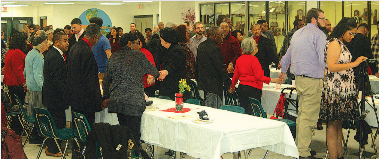
At the conclusion of the Black History Month program at GCHS Saturday, those in attendance joined hands and sang, “Reach Out and Touch Somebody’s Hand.”