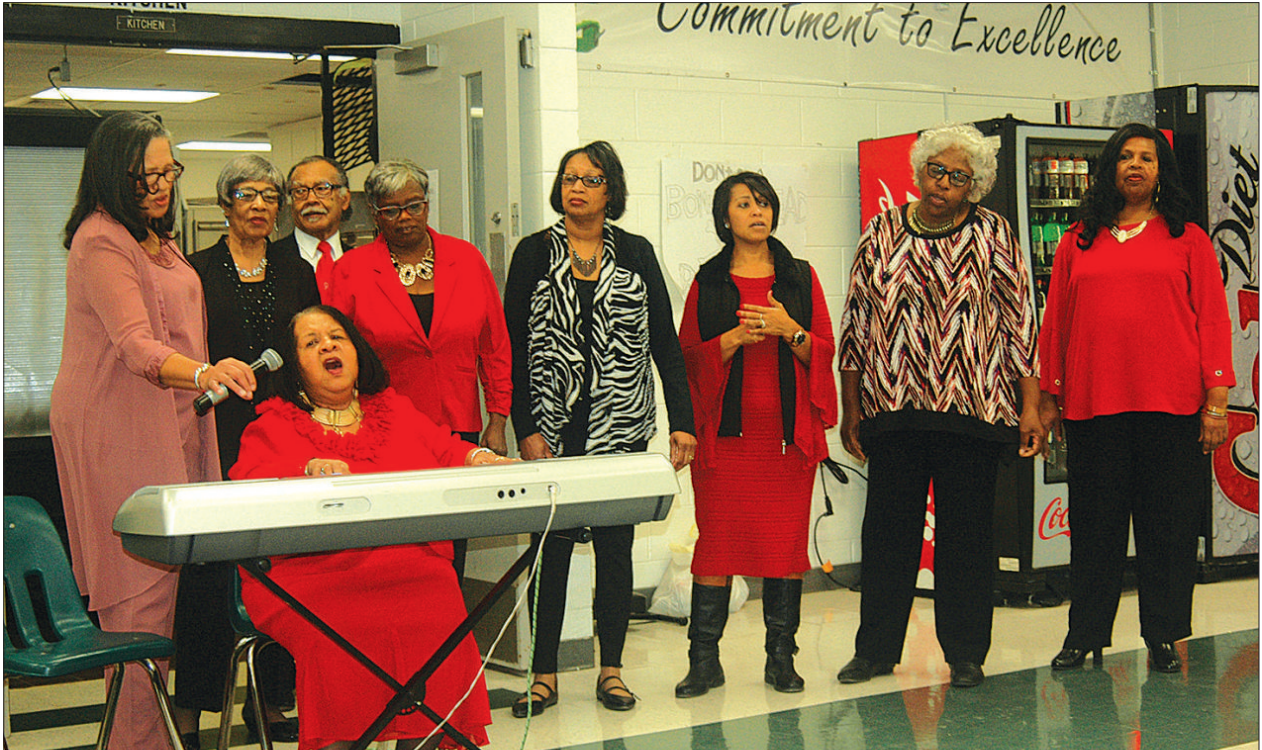
The Second Baptist Choir provided the special music.