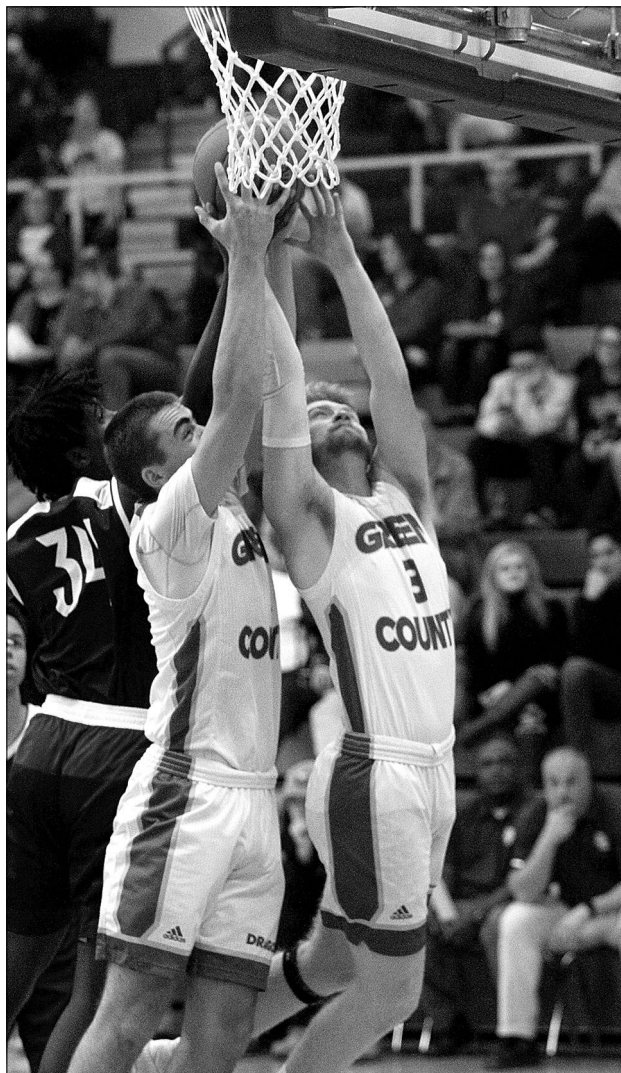
Aggressive rebounding against a much larger team allowed the Dragons to get more fast break opportunities. The Dragons were defeated by the top 18th District team LaRue County Hawks, 49-80, at home Friday. They traveled to Bethlehem Saturday and returned home with a 55-44 win over the Banshees.