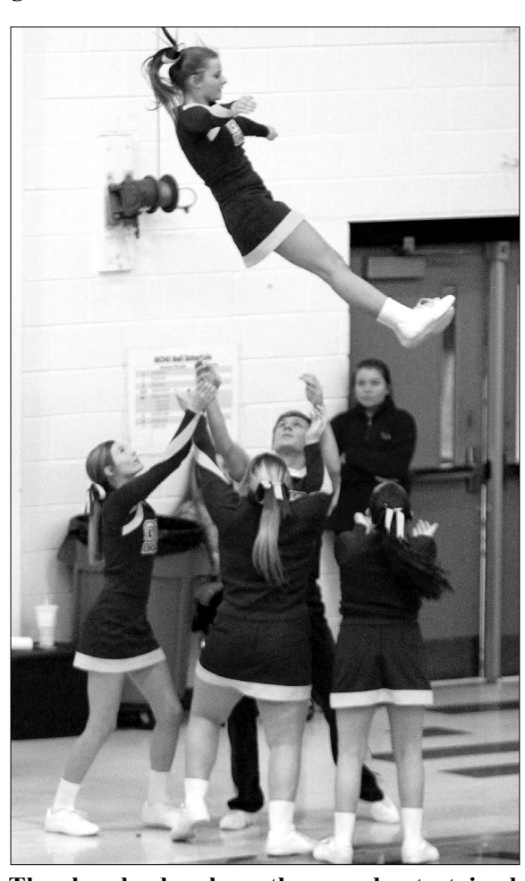
The cheerleaders keep the crowd entertained during the entire duration of ballgames.