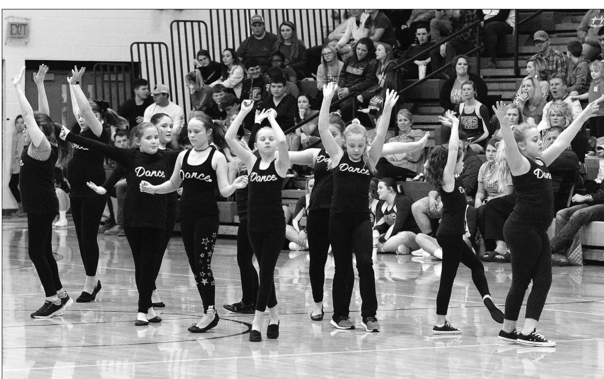
The GCIS dance team practices weekly and frequents local sporting events to show off their well choreographed dance moves. They perform for the crowd during the home high school basketball game last week.