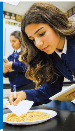
Help ensure FFA continues to thrive in your community. Visit FFA.org/local