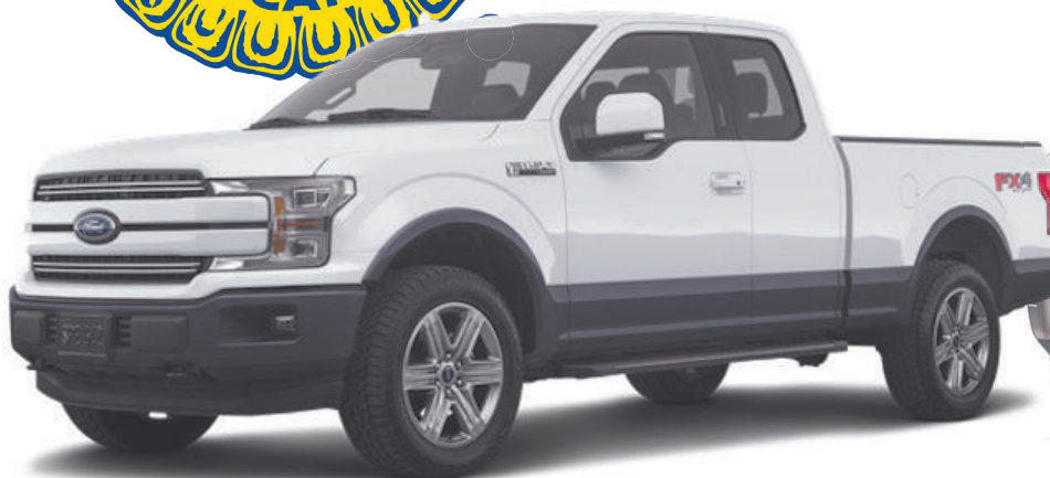
2019 Ford F-150

We take great pride in saluting the Green County FFA Chapter