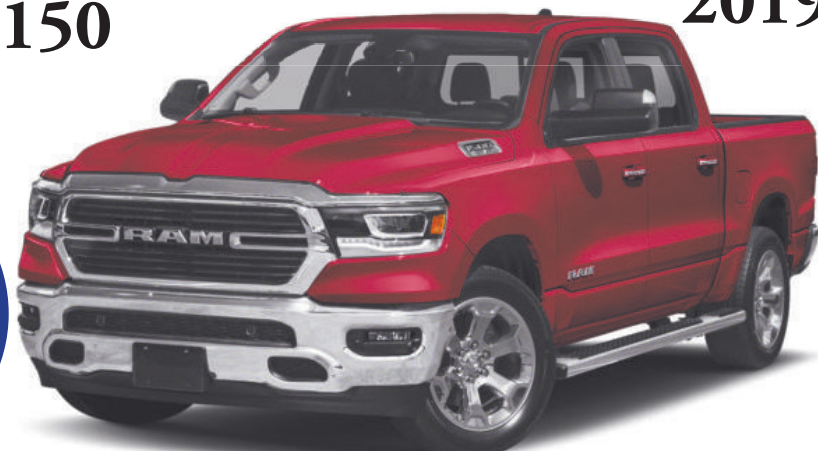
2019 Dodge Ram

Over 4,500 new and used vehicles in stock at 23 locations