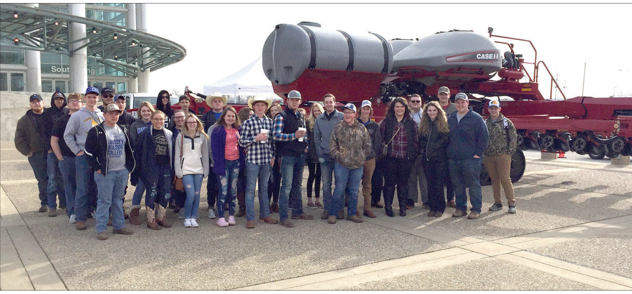
Green County FFA students attended the National Farm Machinery Show Friday in Louisville.