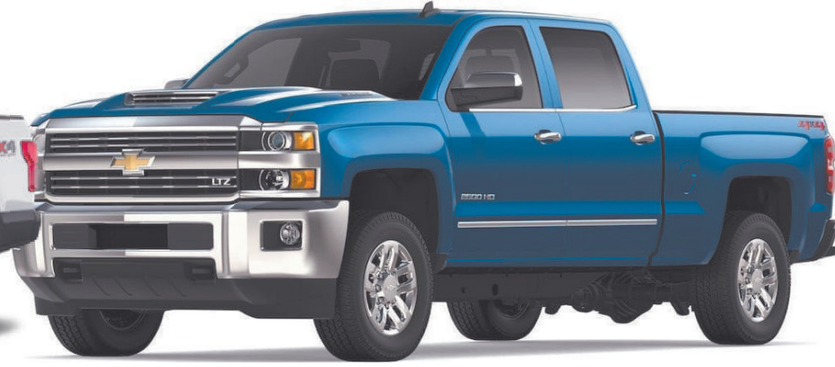
2019 Chevy Silverado

Over 4,500 new and used vehicles in stock at 23 locations